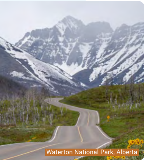
Waterton National Park, Alberta

TRAVEL TIP: Get up early for the best chance to spot wildlife — I watched bighorn sheep playing beside the road and also saw a grizzly bear and black bear with cubs.