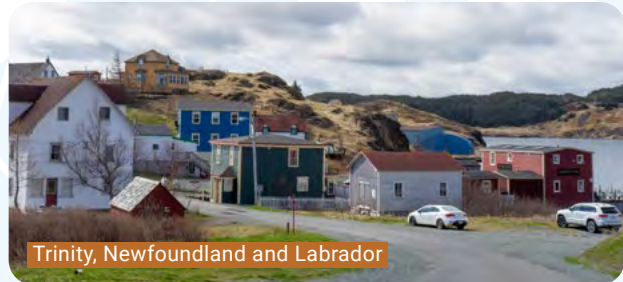
Trinity, Newfoundland and Labrador

Newfoundland offers incredible coastal scenery: lighthouses, icebergs and colourful saltbox homes. But it's the people and traditions that make it special. Which is how I ended up becoming an honorary Newfoundlander in a "screeching in" ceremony. I donned a sou'wester rain hat, kissed a codfish, took a shot of 80-proof screech (rum) and dutifully recited "deed I is, me old cock and long may your big jib draw." Yes, it's touristy — but it's iconic, and a fun way to meet other travellers and connect with the locals.