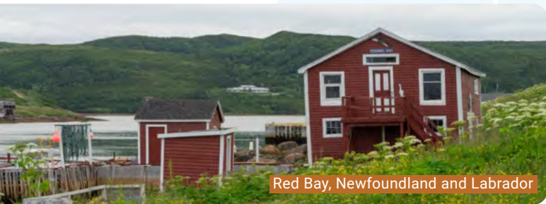
Red Bay, Newfoundland and Labrador

TRAVEL TIP: Newfoundlanders are a friendly bunch. Leave extra time to chat and learn about island life.