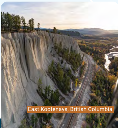
East Kootenays, British Columbia

Whether it's cuisine, mountains, history or ocean views, the variety we have across Canada reminds me why exploring our own country is as rewarding as travelling abroad.