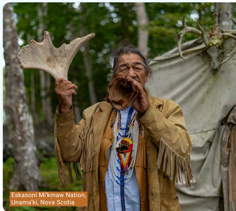
Eskasoni Mi'kmaq Nation, Unama'ki, Nova Scotia

TRAVEL TIP: Don't miss driving the Cabot Trail on Cape Breton Island. The 298-kilometre loop winds along dramatic coastal cliffs, through fishing villages, and into Cape Breton Highlands National Park. Give yourself at least a full day to stop at lookouts, hike a short trail or two and dine on seafood along the way.