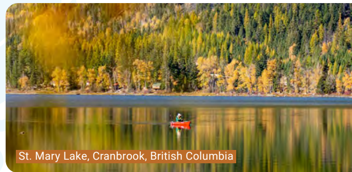
St. Mary Lake, Cranbrook, British Columbia

About 15 minutes outside Cranbrook, Fort Steele Heritage Town offers wagon rides, blacksmith demonstrations and even a working steam train. A visit here is a great day out for families. For a big adrenaline rush, book a helicopter tour over the peaks and glacier fed valleys of the Rockies. I had a front-row seat to the soaring ridgelines and deep valleys carved by ice. It is one of those moments where the scale of the mountains really hits you. It's the kind of view and experience you won't forget.